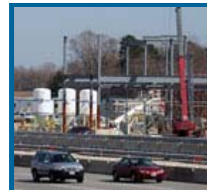
Building under construction at the new eastbound toll plaza at Meyers Road.

Read More About Open Road Tolling | Back to Main Menu