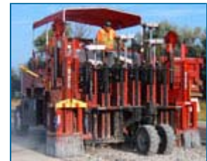
New Technology crumbles old pavement in the "rubblization" of I-88.

Read More About I-88 Rehab | Back to Main Menu