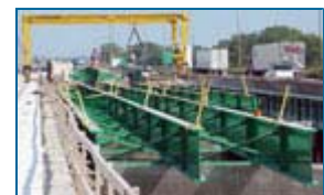
Project includes widening the Markham Yard Bridge.