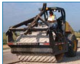
A grading machine compacts and smooths the rubblized concrete base of the road before the asphalt is poured.

If you are a Reagan Memorial Tollway (I-88) driver, you will be among the first Tollway users to reap the benefits of the Illinois Tollway's Congestion-Relief Plan.