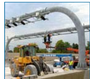
Crews construct ORT monotubes along I-294 at Irving Park Road.