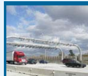
New Open Road Tolling lanes allow drivers to pay tolls at highway speed.

This is the first of eight toll plazas currently under construction that will provide Open Road Tolling lanes by year's end with the conversion of all toll plazas completed by fall 2006. Open Road Tolling and the other