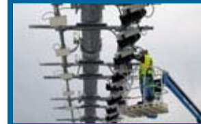
Crews construct ORT monotubes for electronic toll collection.

Read More About Open Road Tolling | Back to Main Menu