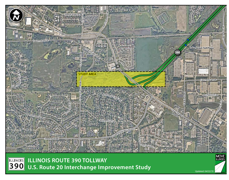
Project Overview Map

In coordination with the Village of Hanover Park, the Illinois Tollway is conducting a Preliminary Engineering and Environmental Study for the U.S. Route 20 (Lake Street) Interchange at Illinois Route 390 (IL 390) Tollway Improvement. The existing interchange at U.S. Route 20 (U.S. 20) is the west terminus of the IL 390 Tollway. The project will determine if extending the IL 390 interchange ramps to County Farm Road can address local traffic issues.