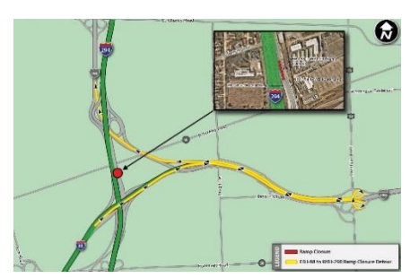
<u>View EB I-88 to</u> WB I-290 Detour Map

Additional lane closures will be scheduled later in June and in July on I-290, as well as the overnight closure and detour of the ramps connecting northbound I-294 and eastbound I-88 to westbound I-290, the ramp connecting eastbound I-290 to southbound I-294 and the ramp connecting southbound I-294 to eastbound I-290. Overnight closures and detours of ramps at the I-290/I-88 Interchange at I-294 are scheduled to continue through the end of the year as needed.