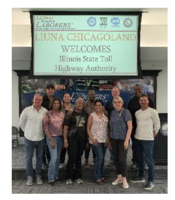
Liuna! Chicagoland Training Center Tour

Local 150 Training Facility – Operator Equipment Simulators