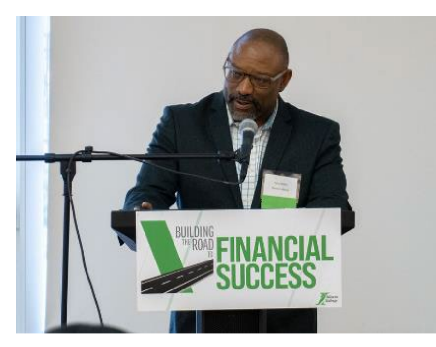
Building the Road to Financial Success: Foundation for Long Term Success Workshop and Networking Event