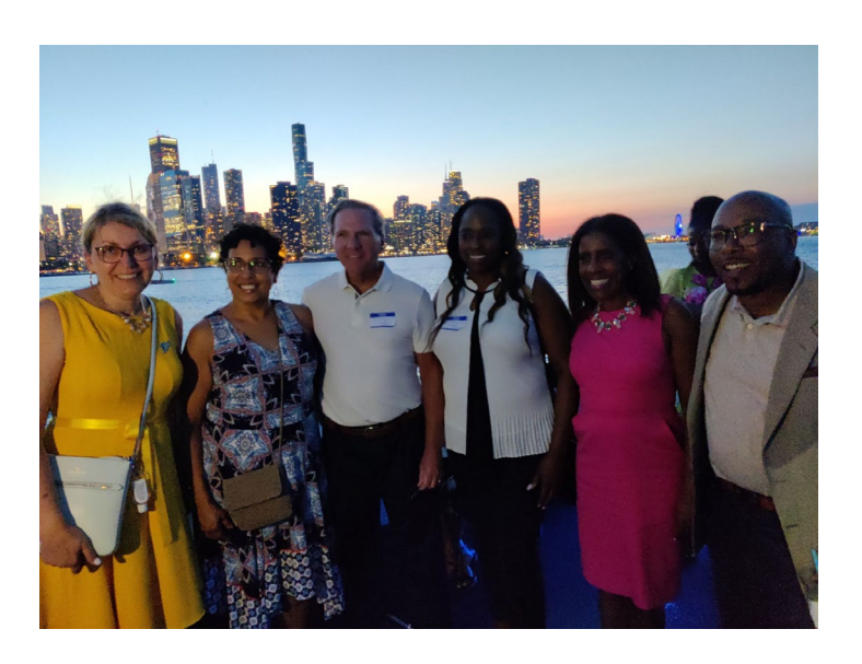
Illinois State Black Chamber of Commerce Pre-Convention Cruise