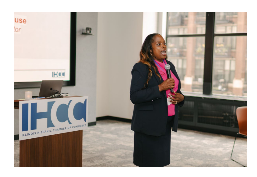
IHCC Business Expo 2023