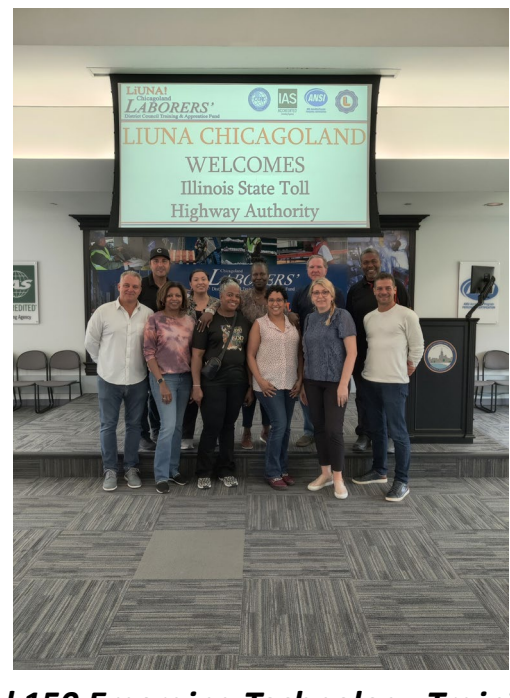
Local 150 Emerging Technology Training