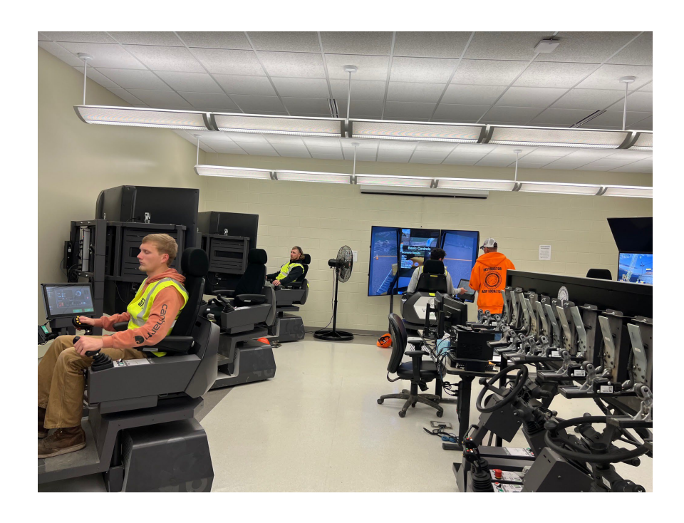
Local 150 Training Facility – Operator Equipment Simulators