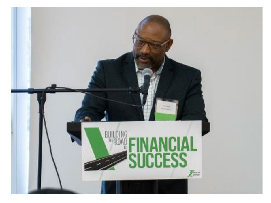
Building the Road to Financial Success: Foundation for Long Term Success Workshop and Networking Event