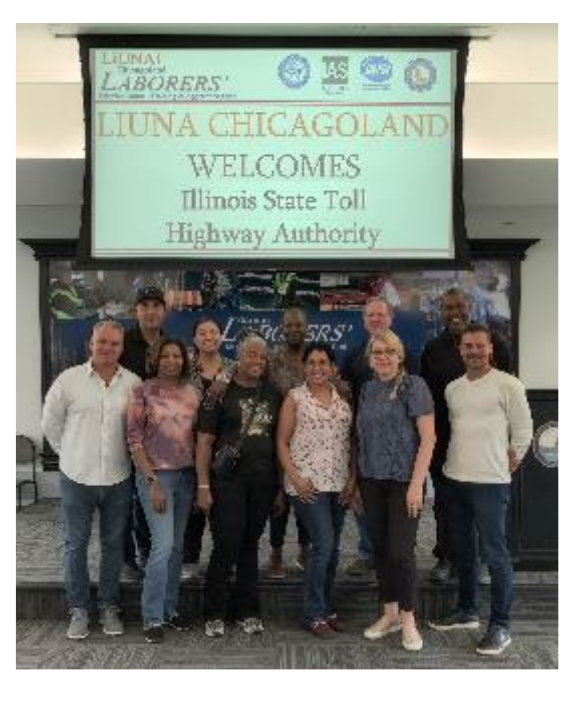
Liuna! Chicagoland Training Center Tour