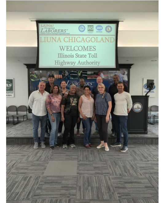
Local 150 Emerging Technology Training