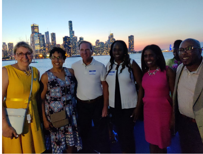
Illinois State Black Chamber of Commerce Pre-Convention Cruise