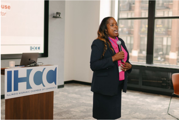
IHCC Business Expo 2023