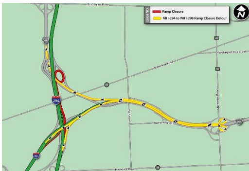
View NB I-294 and EB I-88 to WB I-290 Detour Map