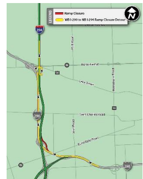
View WB I-290 to NB I-294 Detour Map

Construction and electronic message signs will be in place in advance to alert drivers to the overnight lane closures and detour. Up-to-date closure information will be available on the Illinois Tollway's Daily Construction Alert . All work is weather dependent.