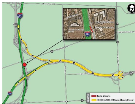
View EB I-88 to NB I-294 Detour Map