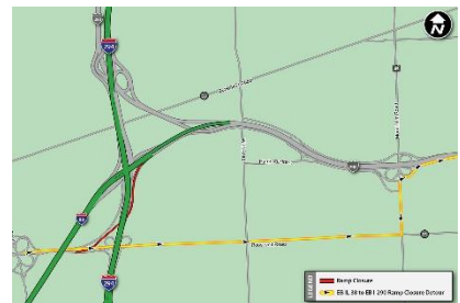
EB Roosevelt Rd to EB I-290 View Map