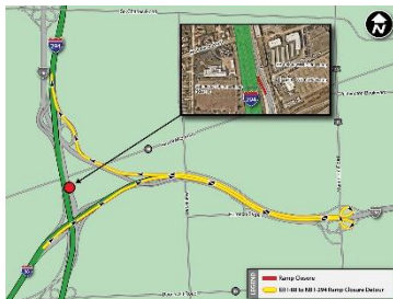
EB I-88 and WB I-290 to NB I-294 View Map