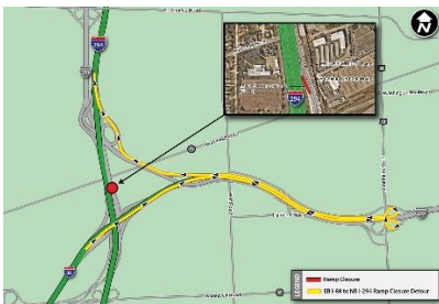
NB I-294 and EB I-88 to WB I-290 View Map