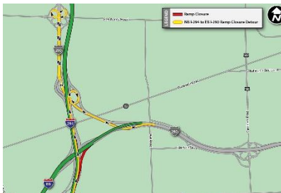
NB I-294 to EB I-290 View Map

Overnight closures and detours of ramps at the I-290/I-88 Interchange at I-294 are scheduled to continue through the end of the year as needed. Information including maps and construction updates is available on the Tollway's website at www.illinoistollway.com in the Projects section.