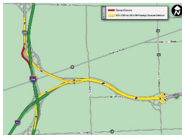
EB I-290 to SB I-294 and WB I-88 View Map