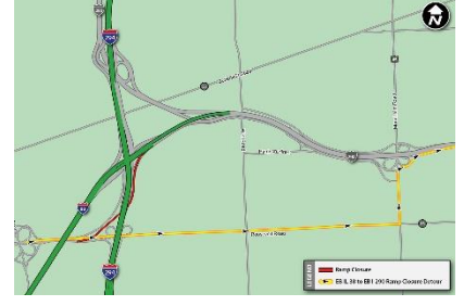
WB I-290 to SB I-294 and WB I-88 <u>View Map</u>