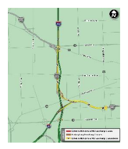
EB I-88 to NB I-294 and WB I-290 View Map