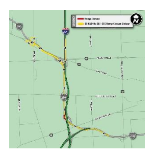
SB I-294 to EB I-290 <u>View Map</u>