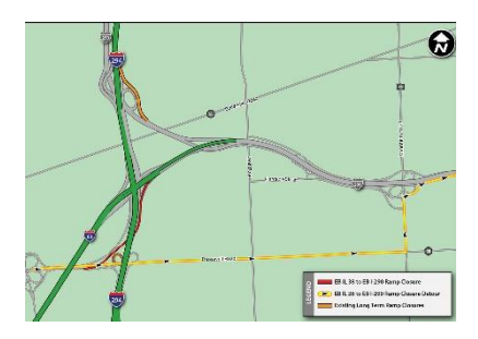
EB Roosevelt Rd to EB I-290 <u>View Map</u>

In addition, on eastbound I-290 between St. Charles Road and Butterfield Road several nights of lane closures, including intermittent, 15-minute full closures, will be needed in November for bridge beam removal on northbound I-294 over I-290. The closures will be scheduled during overnight hours with lanes and ramps reopening ahead of the morning rush hour.