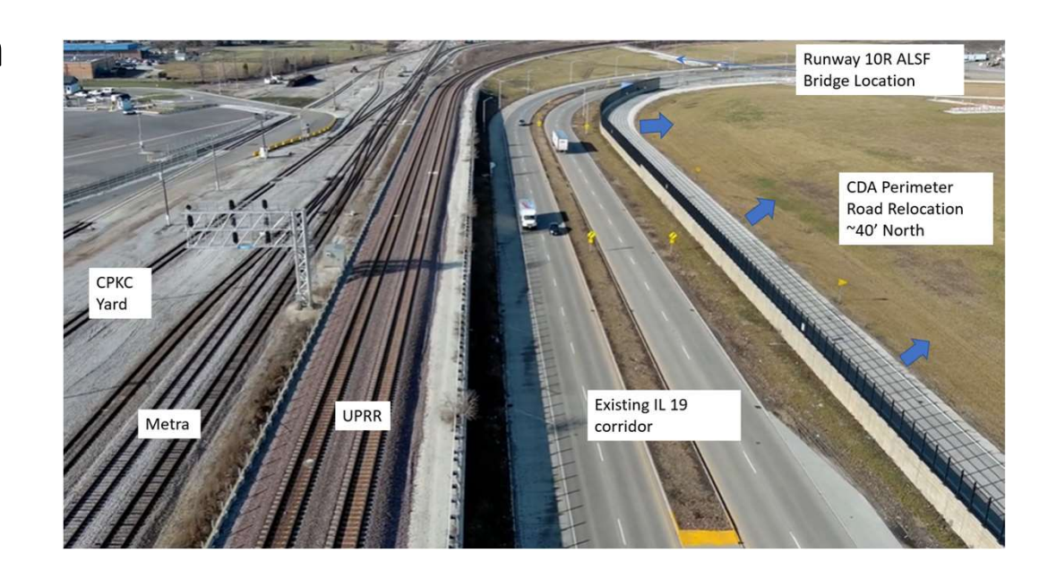
Looking West along Irving Park Road @ Southwest Corner of Airport