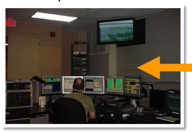
Dispatch Center - CAD