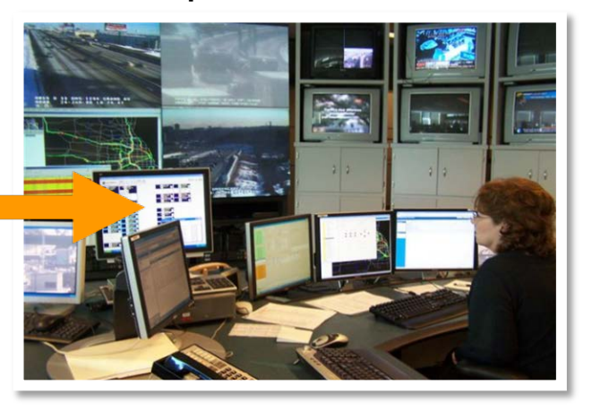
Traffic Operations Center - TIMS