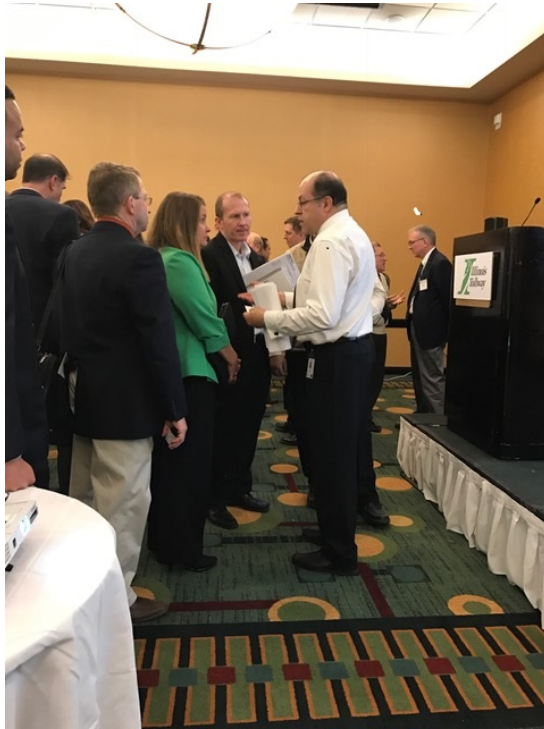
2017 Professional Services Bulletin Networking Event March 14, 2017

Policy Committee June 5, 2017 at 10 a.m.