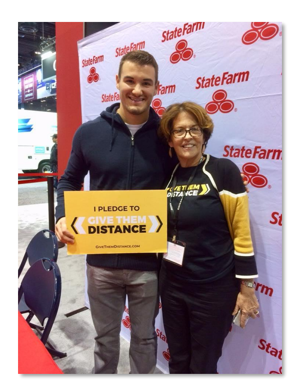
Chicago Bears Quarterback Mitch Trubisky