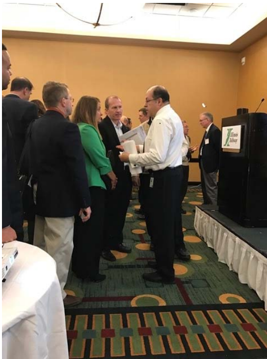
2017 Professional Services Bulletin Networking Event March 14, 2017

Policy Committee April 17, 2017, at 10 a.m. June 5, 2017, at 10 a.m.