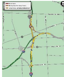
SB I-294 to EB I-290 View Map