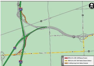
EB Roosevelt Rd to EB I-290 View Map