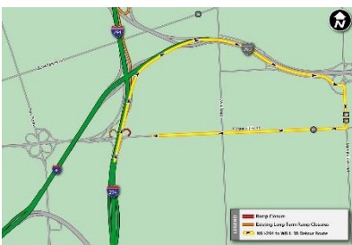
NB I-294 to WB Roosevelt Rd View Map

Construction work in June will also require roadway lane closures. All lane closures will be scheduled during overnight hours with lanes and ramps reopening ahead of the morning rush hour.