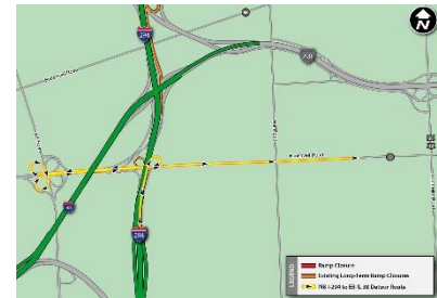
NB I-294 to EB Roosevelt Rd View Map