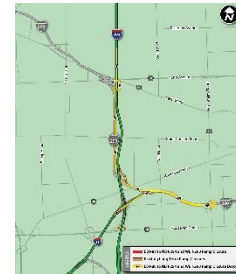
EB I-88 to NB I-294 and WB I-290 View Map