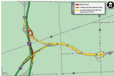
NB I-294 to WB I-290 View Map

In addition, the ramps at the St. Charles Road Interchange on I-290 are scheduled to close as needed. No detours will be posted.