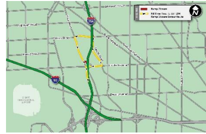
NB River Road to SB I-294 View Map