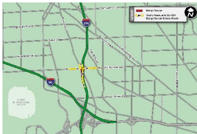
Touhy Avenue to SB I-294 View Map