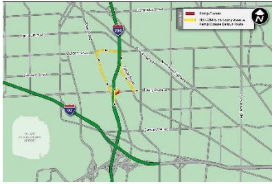
NB I-294 to EB Touhy Avenue View Map