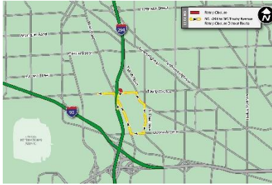
NB I-294 to WB Touhy Avenue View Map